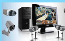
Software and Surveillance System