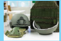
Bullet Proof Body Gears