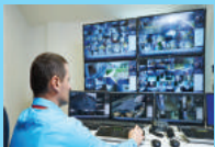
CCTV with Control Room