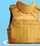
Bullet Proof Jacket