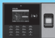
Biometric Attendance Device